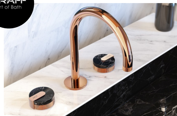
Graff Plumbing fixtures