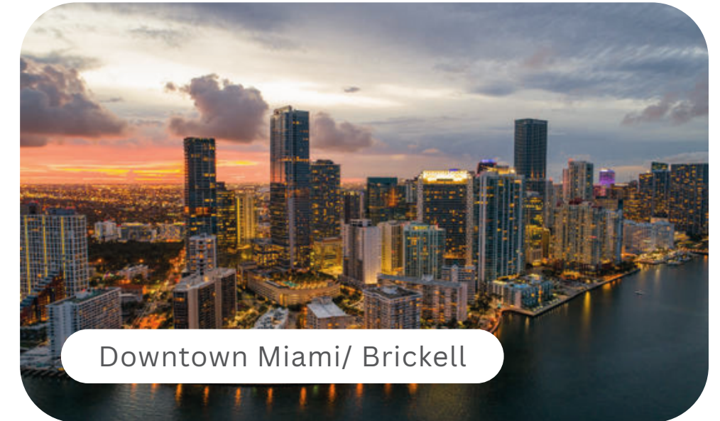
Downtown Miami/ Brickell