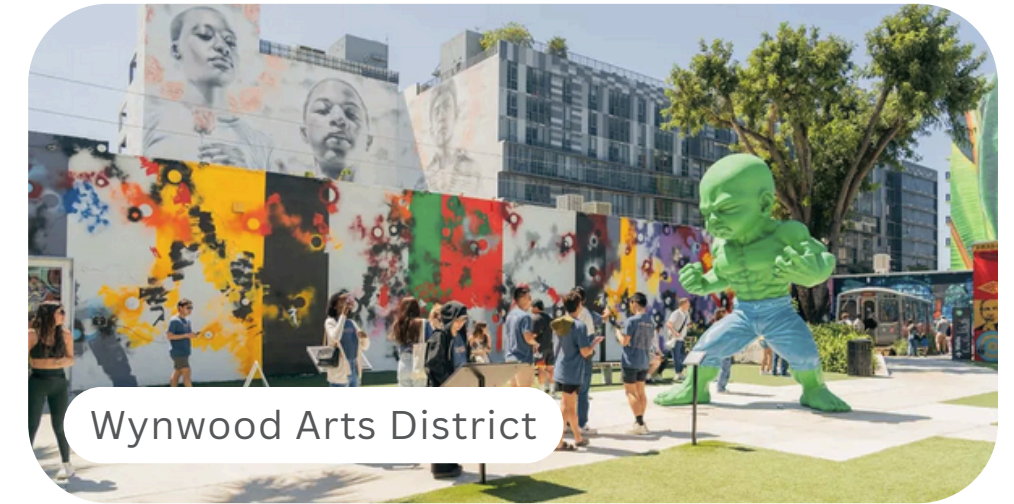
Wynwood Arts District