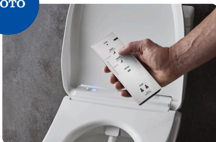
Toto Toilets (Electric Bidet in all Masters, And regular in others)