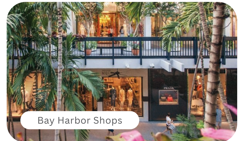
Bay Harbor Shops