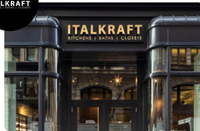
Italkraft kitchens and Vanities