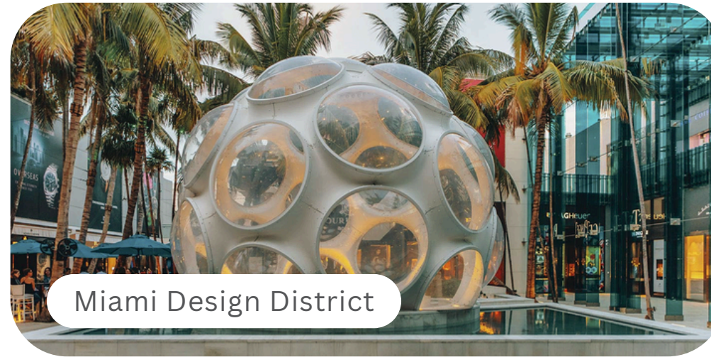
Miami Design District

Today's Miami is a tapestry of complexity. It's vibrant, yet also rooted in tranquility. ALMA offers you a bridge between these two realms. Just a few minutes away from the artistic flair of Wynwood, the fashionable vibes of the Design District, and the bustling business hub of Brickell, while providing a serene retreat filled with nature and spaciousness at home.